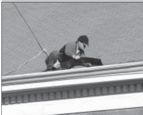
On top of things. See page 1.