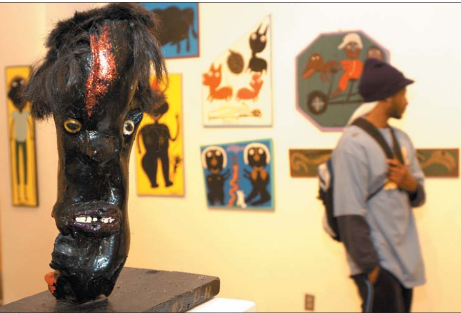
Gallery exhibit "Bupe," in foreground, a sculpture by Georgia artist Bessie Harvey, is one of a collection of artworks on display through March 5 in Biggin Gallery. The Department of Art exhibit, in observance of Black History Month and Women's History Month, presents exceptional works since the 1960s by self-taught African-American women artists.