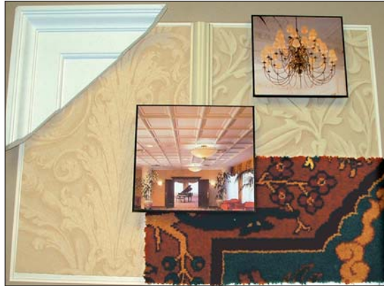
Makeover upgrade The AU Hotel and Dixon Conference Center will feature plusher materials and more attention to detail in public areas of the hotel, above, and the conference center's auditorium, below.

The conference center is slated for renovation early next year. International themes expressed in the lobby and other public areas of the hotel will carry over to the conference center, Bettcher said.